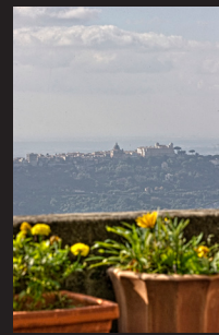
The view from Palazzola